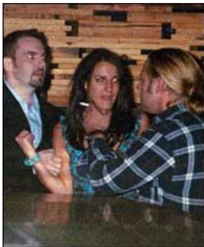
Fist clenched ... she is held back

The actor, famed for his roles in LA Confidential and A Beautiful Mind, came to Britain last week for the funeral of his fellow actor and drinking buddy Richard Harris.