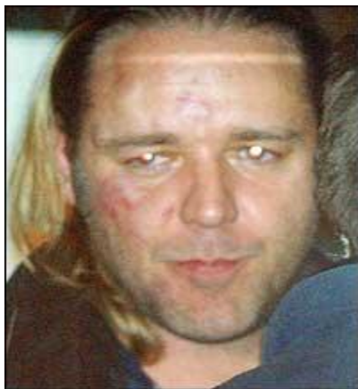
Movie wildman ... star Russell Crowe after yesterday's amazing punch-up at Zuma