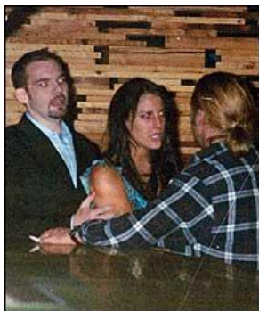
Fury ... Crowe rows with girl

"One of Crowe's minders rushed in after hearing shouting and found Crowe lying on the ground with the other guy on top of him.